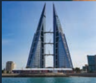
Bahrain World Trade Centre