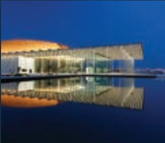
Bahrain National Theatre