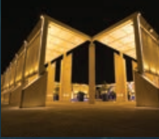
Bahrain National Museum